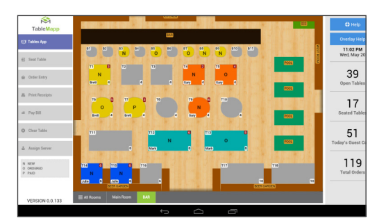
Manage your orders and tables with a customizable map of your restaurant

Quickly seat and open orders from your table map. TableMapp even provides the status of each table giving your staff the tools needed to provide a great experience. Quickly view data such as the number of open tables, seated tables, guest counts, total number of orders and so much more. With TableMapp, your restaurant has never looked better.