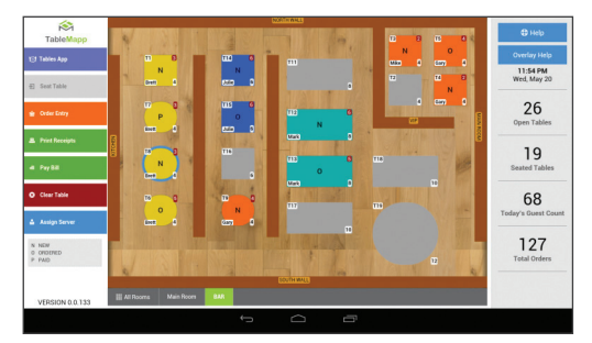
Quickly view the status of each table, to see if they have just been seated, have ordered, or have paid